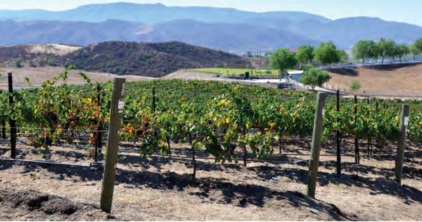
Gaits in the Grapes