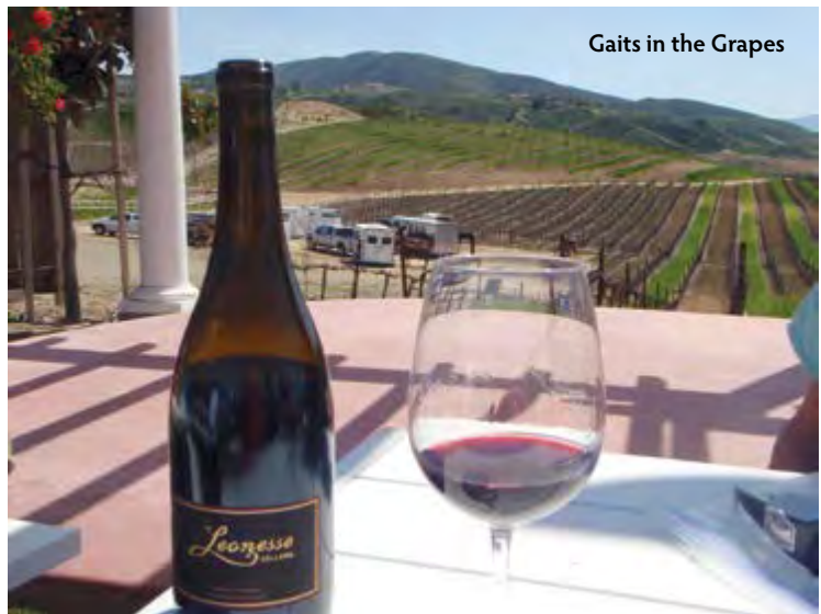
Gaits in the Grapes

This no cookie-cutter, one size fits all riding experience, as you'll soon discover. It all begins with a detailed question-